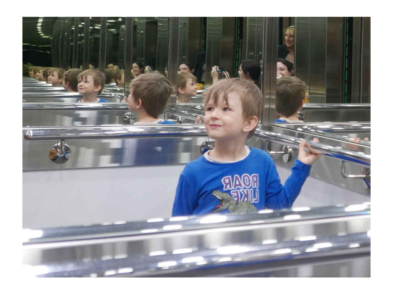
Visiting the Museum will be fun!