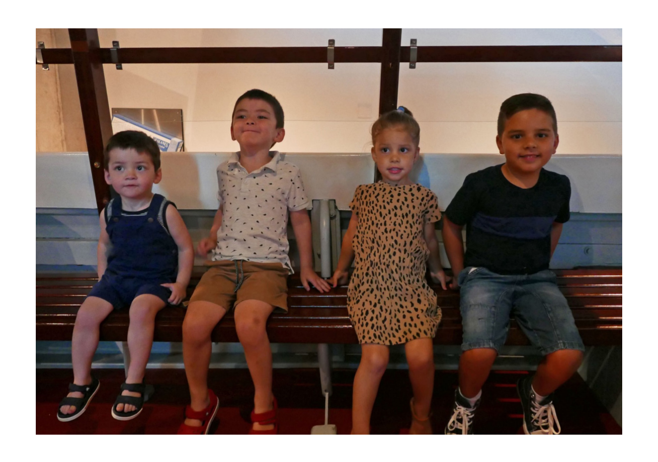
Visiting the Museum will be fun!