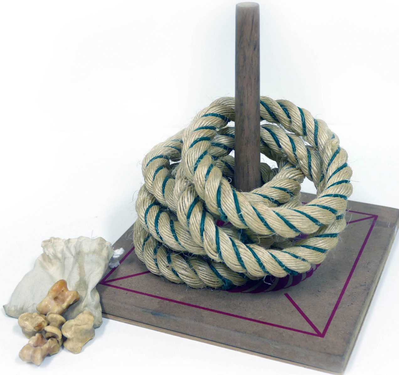
Quoits and Knucklebones