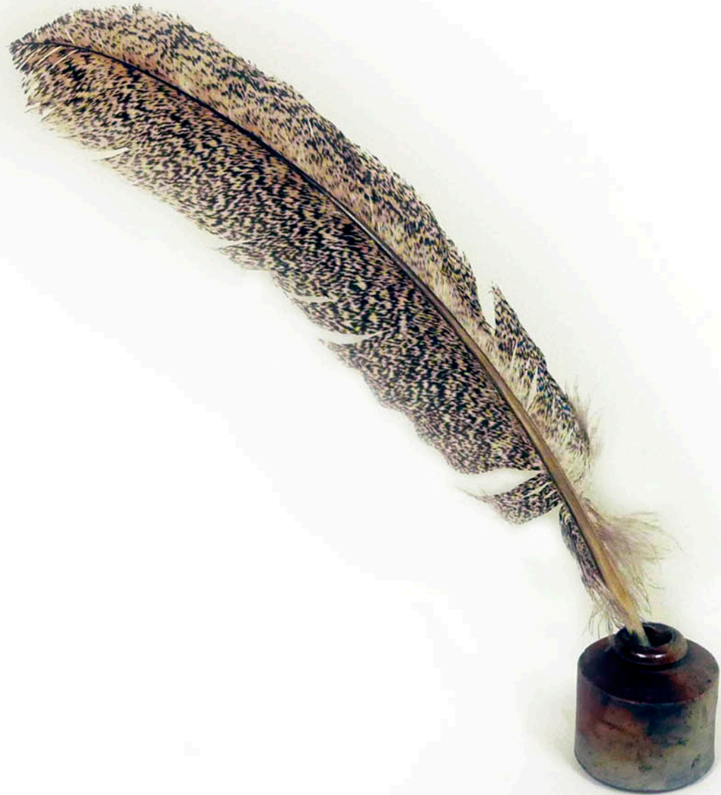
Quill and Ink