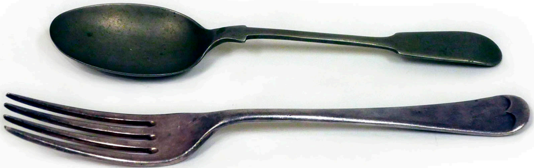
Fork and Spoon