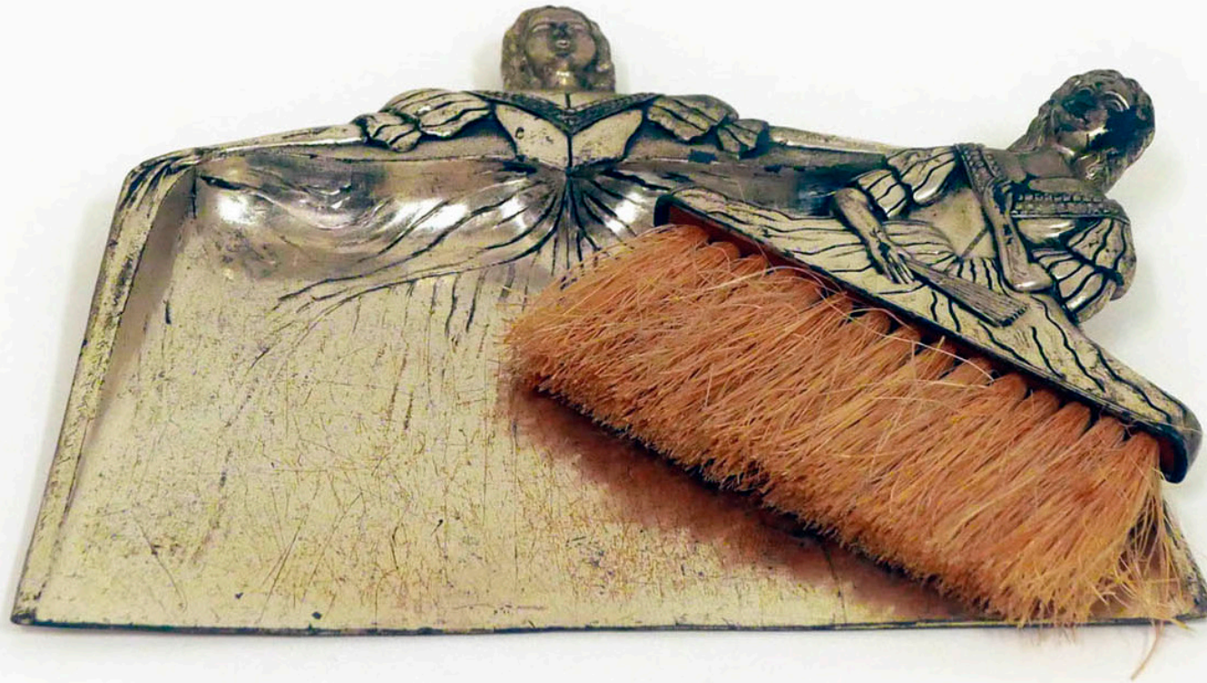
Dustpan and Brush