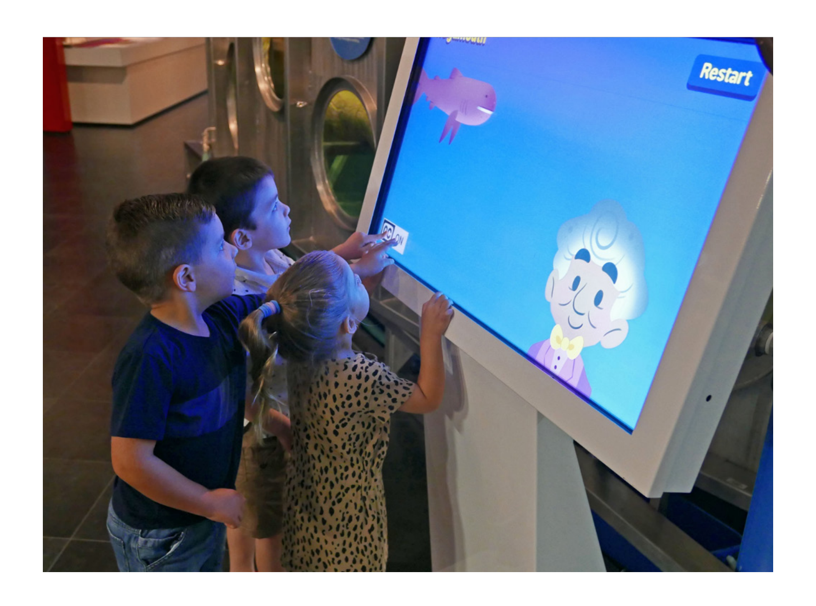
I will be able to touch some things at the Museum.