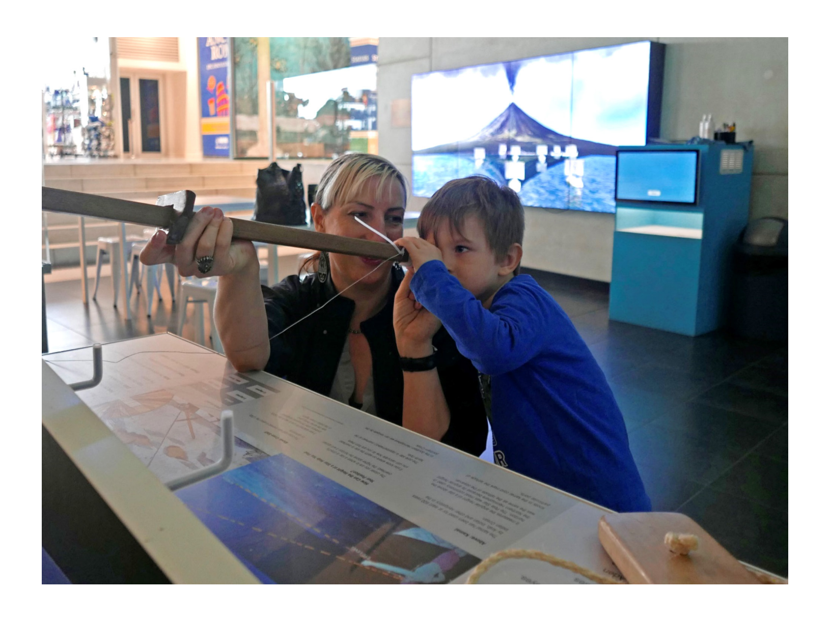
I will see and do many different things at the Museum.