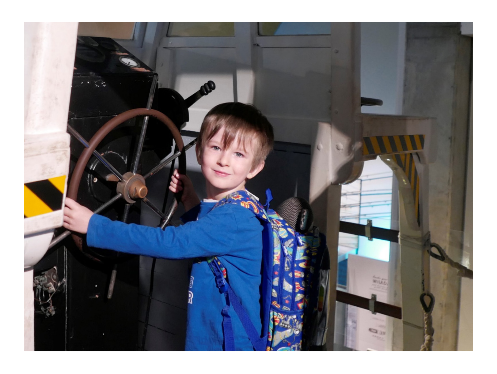
Visiting the Museum will be fun!