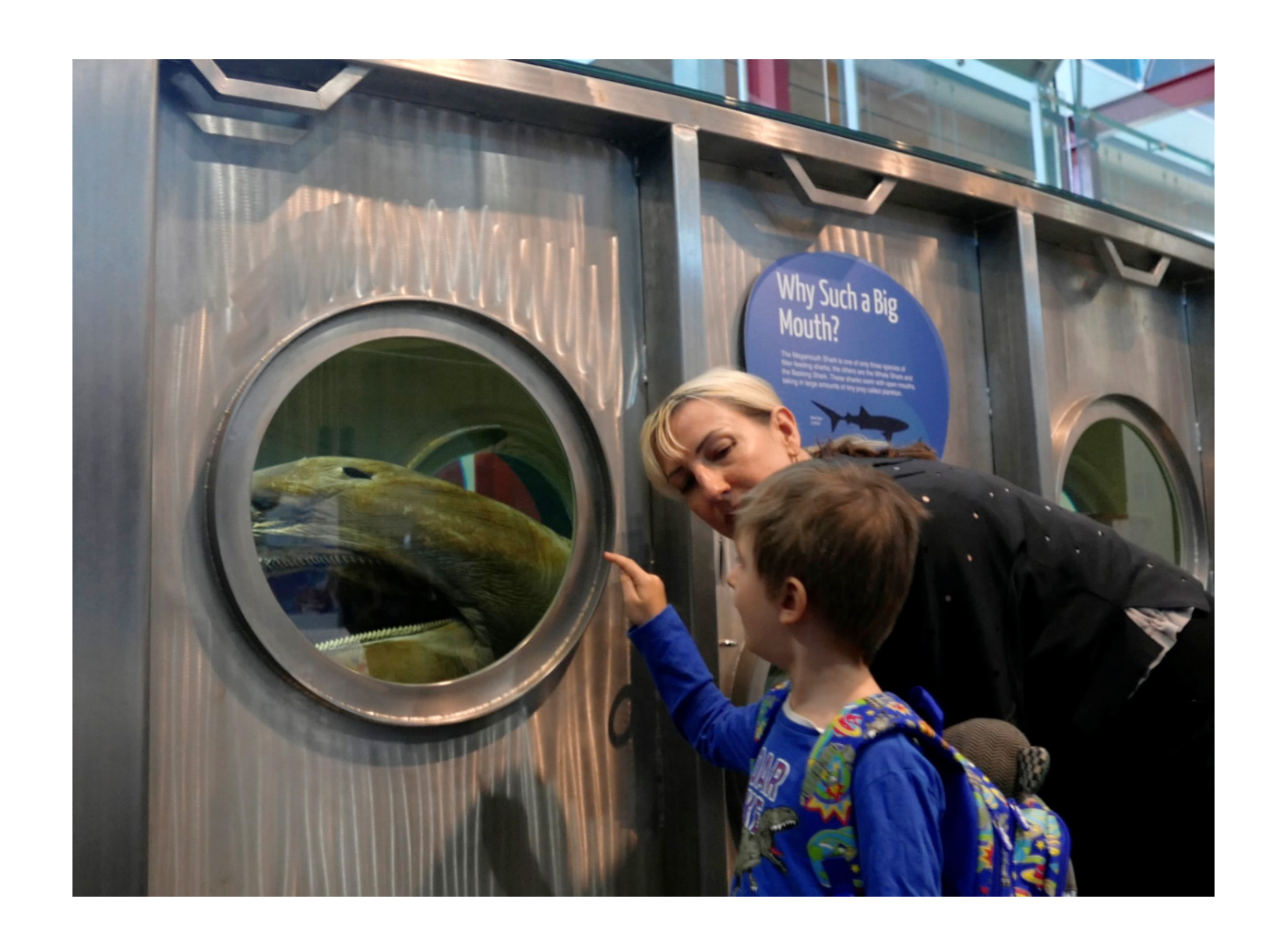
I will see animals and people. They might look strange, but they can't hurt me.