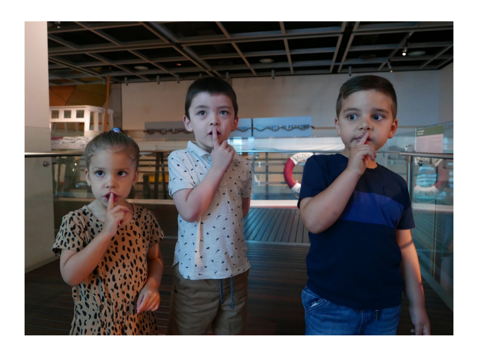
Inside the Museum, I will use a quiet voice.