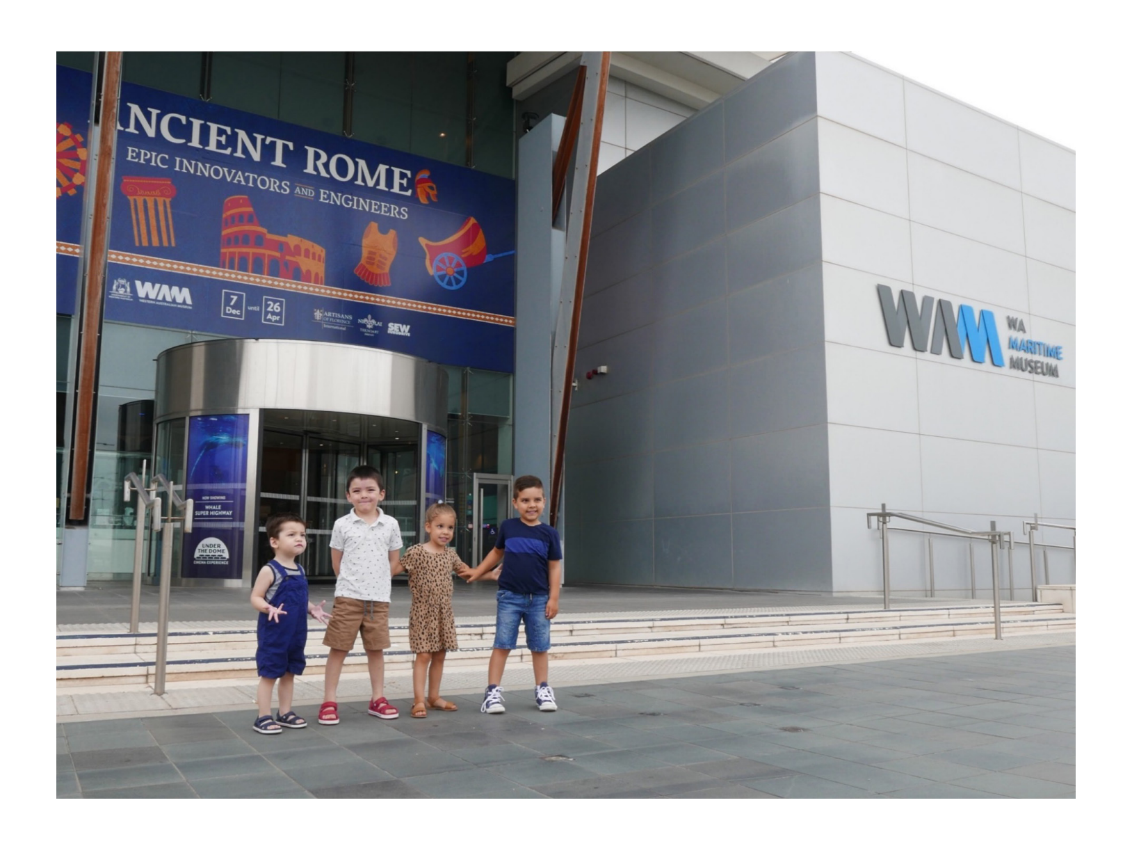
I am going to the WA Maritime Museum.