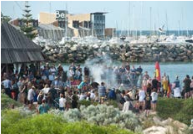
One Day In Fremantle, Bather's Beach, 2019 Freo's View: freoview.wordpress.com

Spot the wooden hut that you can see in this photo of a smoking ceremony. Performed by an Elder to cleanse and purify the area, these ceremonies have been held many times on this beach and nearby.