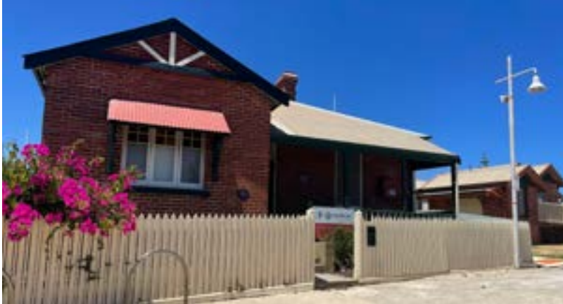
Walyalup Aboriginal Cultural Centre

At the Walyalup Aboriginal Cultural Centre, people learn and share culture, stories and arts, taught by local Aboriginal artists and Elders. The steps just past the Round House lead to the building in the photo so students can view it from the outside. Find out more about the wonderful range of programs offered in each Nyoongar season: https://www.fremantle.wa.gov.au/arts-culture/walyalup-program