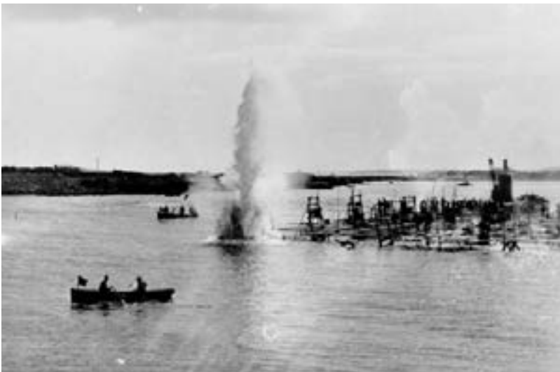
Fremantle Harbour Blasting, 1894

State Library of Western Australia 009026D/BA1328/10.