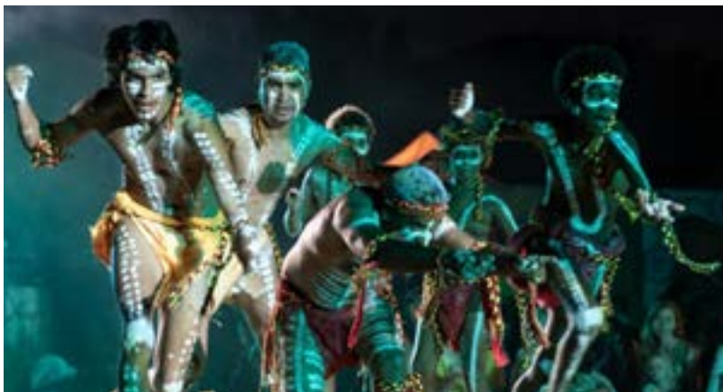
Wardarnji City of Fremantle

Behind the Round House is High Street, where Japingka Aboriginal Art Gallery is situated. Their website contains culturally, and Education Department approved lesson plans and resources for students, as well as interviews with artists, stories, iconography and exhibitions: https://www.fremantle.wa.gov.au/arts-culture/walyalup-program