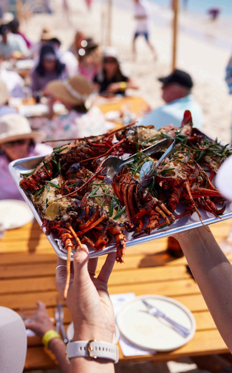
TABLE FEAST DINNER

From $260 per person | Based on 80pax | Level 1 | 4.5hr Event